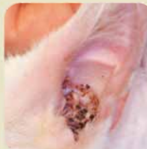
Otitis externa in a cat with ear mites ( Otodectes cynotis ). The photo shows the characteristic crusty brown discharge in the external ear canal