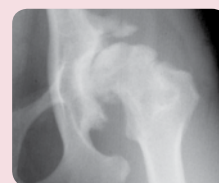
X-ray of an arthritic hip joint in a dog. The symptoms of arthritis are often much worse in overweight pets.